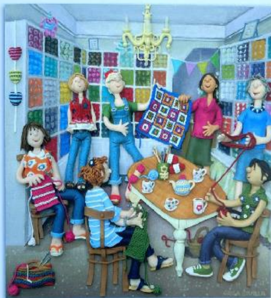
Knit and natter

A friendly, social group who meet at The Thomas Poole Library